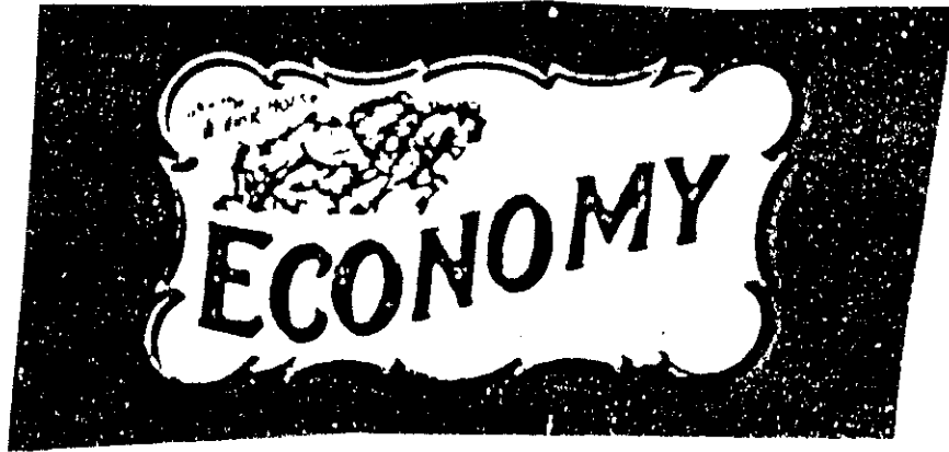
Economy tag in use from sometime in 1913, found on the front of the hopper.

In the fall 1921 issue of the Sears catalog, the Economy "bow tie or propeller" decal made its appearance. Sears had filed for registration of that trademark on October 8, 1920. Interestingly, Sears claimed use since July 1, 1910. Where was it hiding for eleven years? The "bow tie" trademark as registered shows the symbol of the scales of justice in the background. This symbol is not visibly shown on illustrations in the Sears catalogs until the fall 1927 issue. This same decal with "justice," the open letters and the two line border can then be seen in catalog illustrations into the 1930s. ○