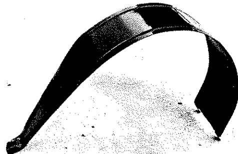
Photo #3: Crank guard made from heavy-duty sheet metal. A bead is rolled into the metal to stiffen the guard.