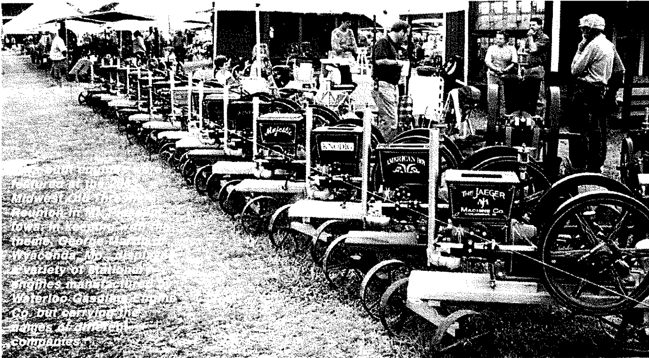
These vintage tractors and engines were on display at the Midwest Old Threshers Reunion in Mt. Pleasant, Iowa. In the foreground, from left to right, are a Hercules, a Knott, an American, and a Jaeger. The variety of engines manufactured in Waterloo, Gasoline Engine Co. but carrying the names of other companies.